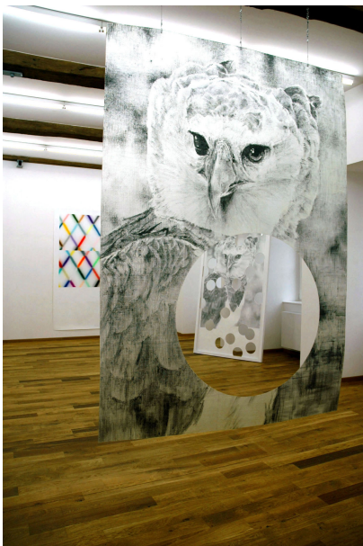
AJOUR. Petite ouverture laissant passer le jour ... Exhibition View Nosbaum Reding, Luxembourg, 2008