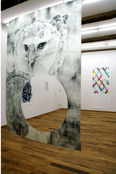
AJOUR. Petite ouverture laissant passer le jour ... Exhibition View Nosbaum Reding, Luxembourg, 2008