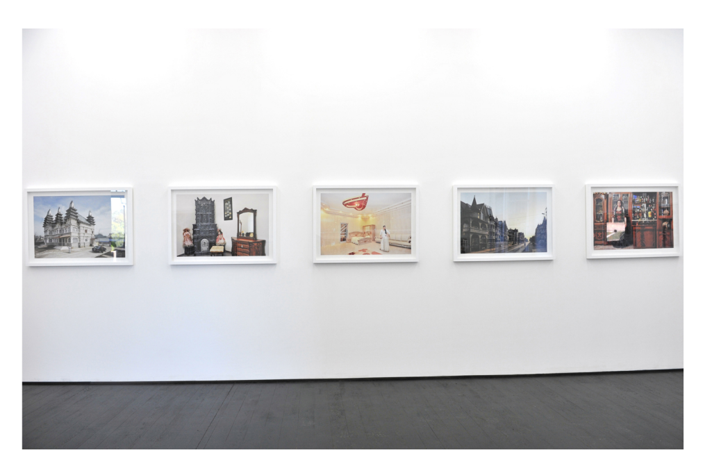
Gypsy Queens Exhibition View Nosbaum Reding, Luxembourg, 2013