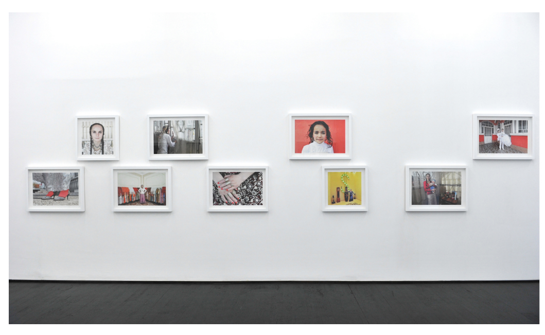
Gypsy Queens Exhibition View Nosbaum Reding, Luxembourg, 2013