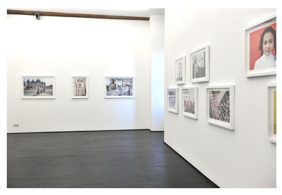
Gypsy Queens Exhibition View Nosbaum Reding, Luxembourg, 2013