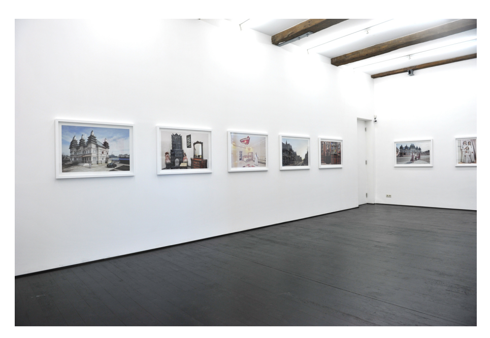
Gypsy Queens Exhibition View Nosbaum Reding, Luxembourg, 2013