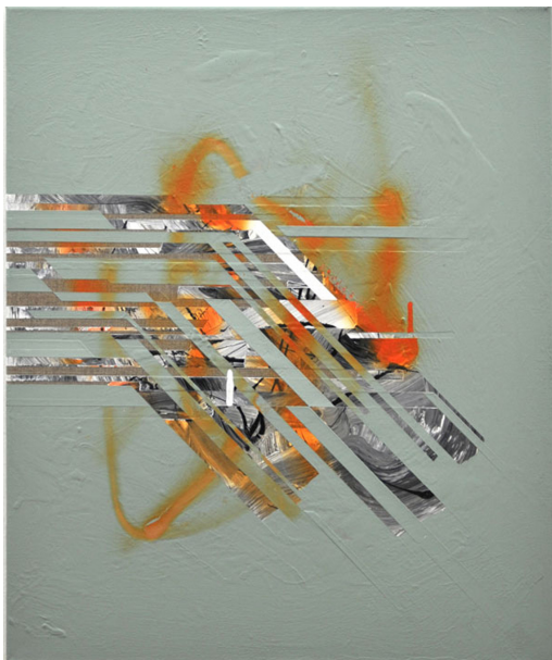
Works in at least two dimensions Exhibition View Nosbaum Reding, Luxembourg, 2013