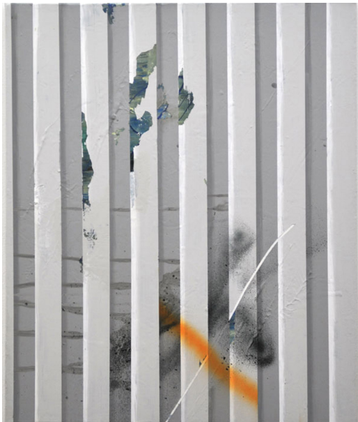
Works in at least two dimensions Exhibition View Nosbaum Reding, Luxembourg, 2013