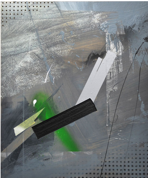
Works in at least two dimensions Exhibition View Nosbaum Reding, Luxembourg, 2013