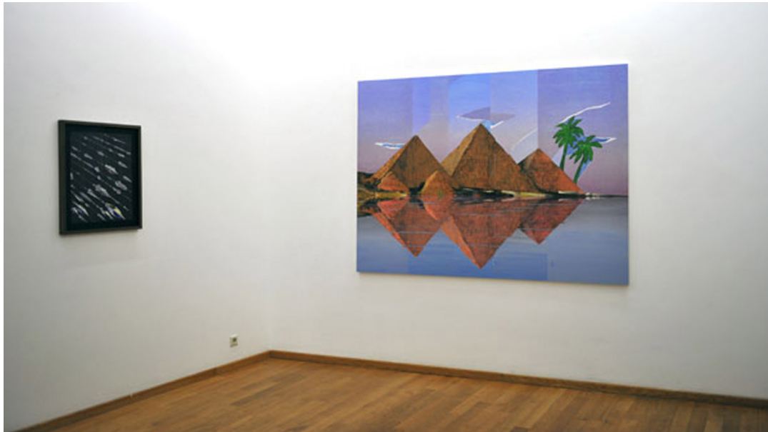
Works in at least two dimensions Exhibition View Nosbaum Reding, Luxembourg, 2013