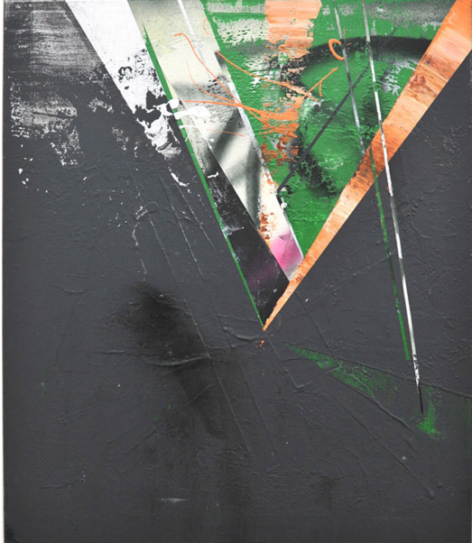
Works in at least two dimensions Exhibition View Nosbaum Reding, Luxembourg, 2013