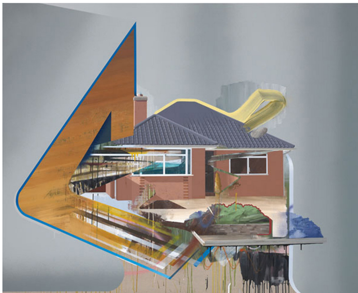
Works in at least two dimensions Exhibition View Nosbaum Reding, Luxembourg, 2013