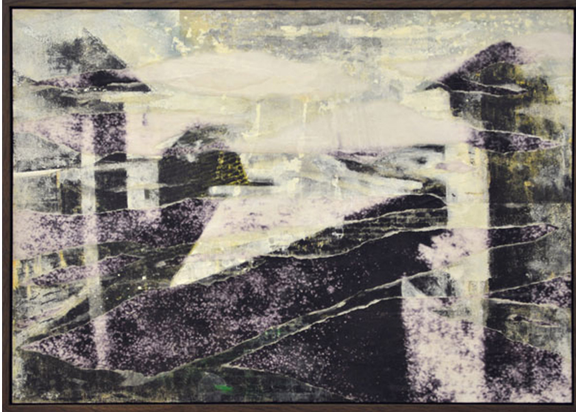
Works in at least two dimensions Exhibition View Nosbaum Reding, Luxembourg, 2013