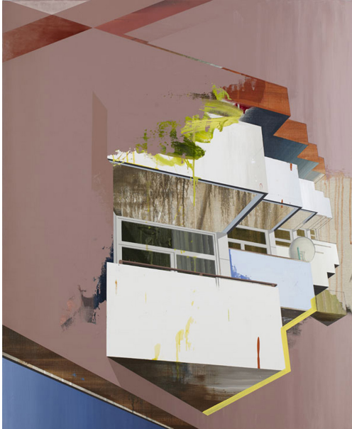
Works in at least two dimensions Exhibition View Nosbaum Reding, Luxembourg, 2013