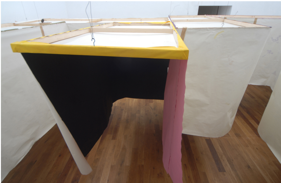
Labyrinth Exhibition View Nosbaum Reding, Luxembourg, 2007