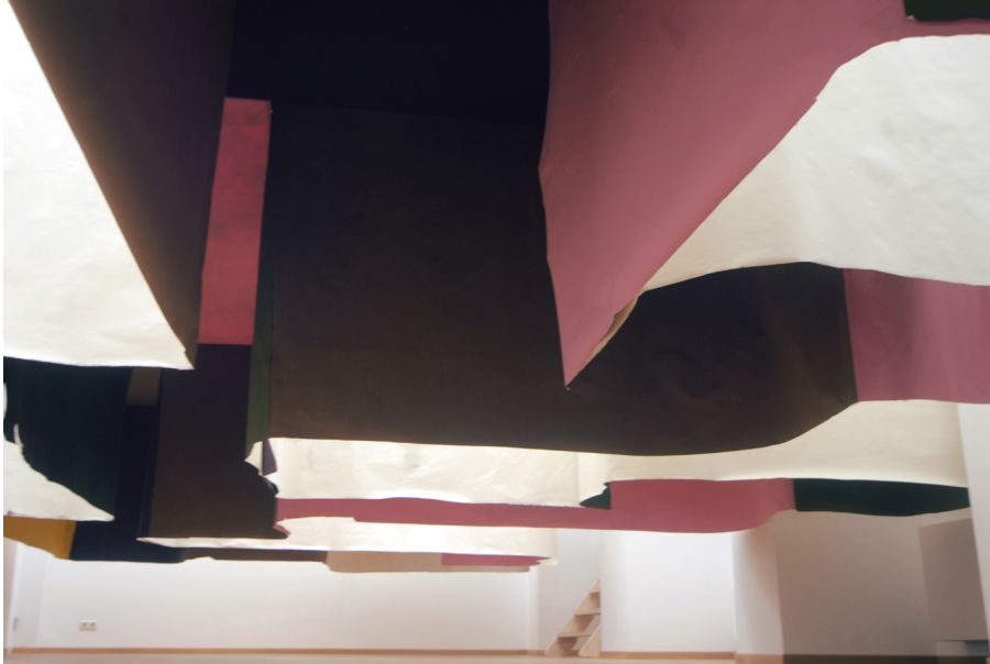
Labyrinth Exhibition View Nosbaum Reding, Luxembourg, 2007