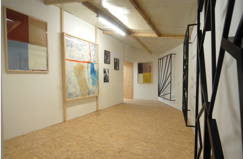
Labyrinth Exhibition View Nosbaum Reding, Luxembourg, 2007