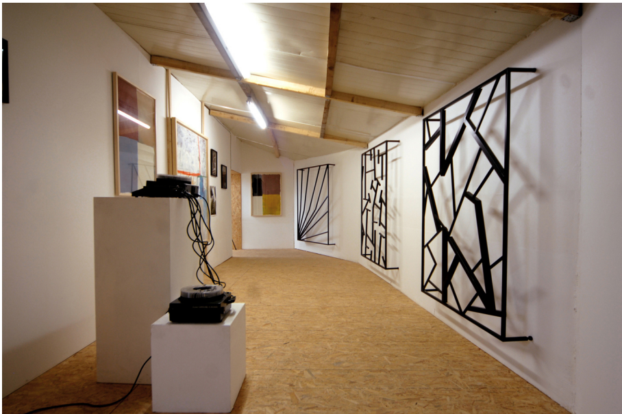
Labyrinth Exhibition View Nosbaum Reding, Luxembourg, 2007