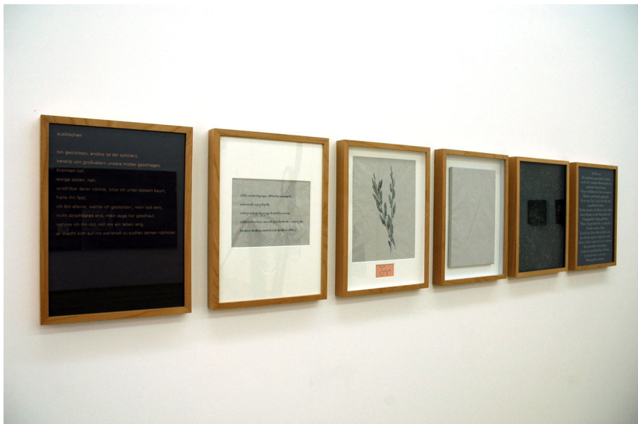
The Pain Game Exhibition View Nosbaum Reding, Luxembourg, 2009