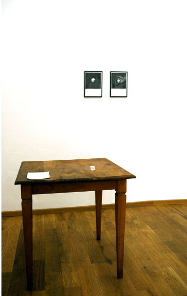
The Pain Game Exhibition View Nosbaum Reding, Luxembourg, 2009