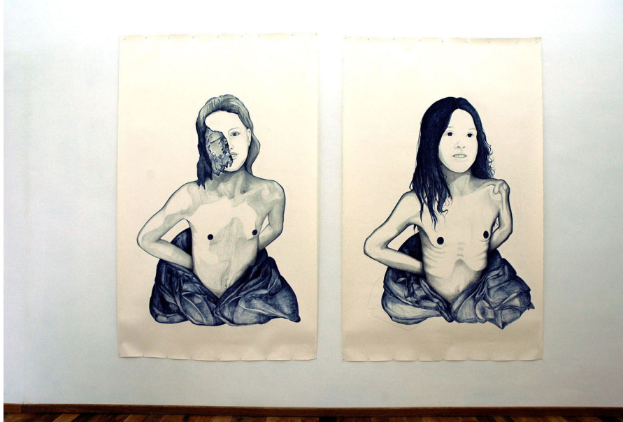
The Pain Game Exhibition View Nosbaum Reding, Luxembourg, 2009