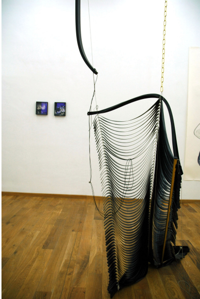
The Pain Game Exhibition View Nosbaum Reding, Luxembourg, 2009