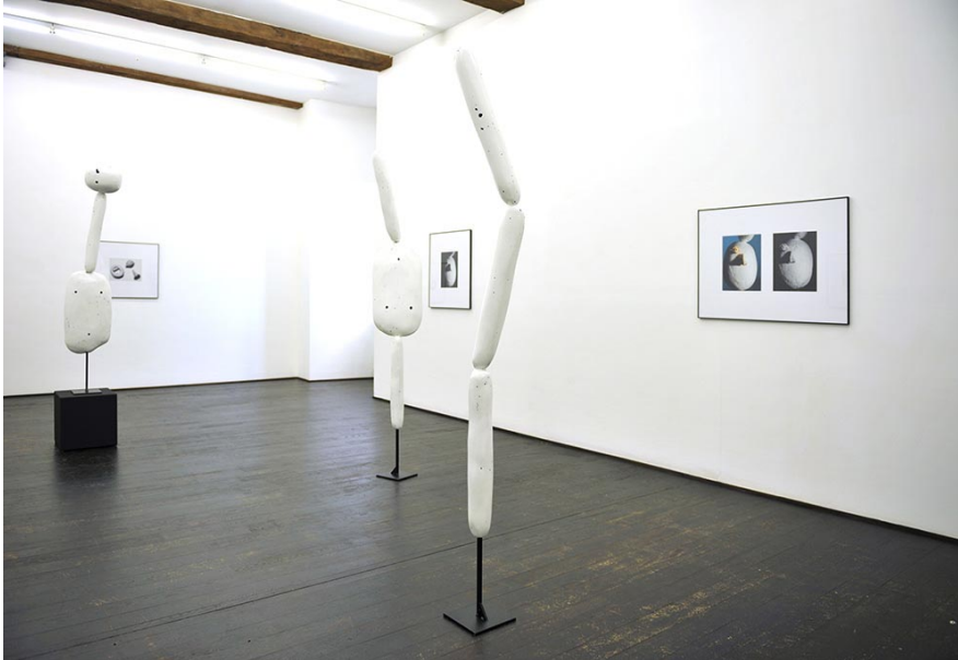
Void Flowers Exhibition View Nosbaum Reding, Luxembourg, 2015