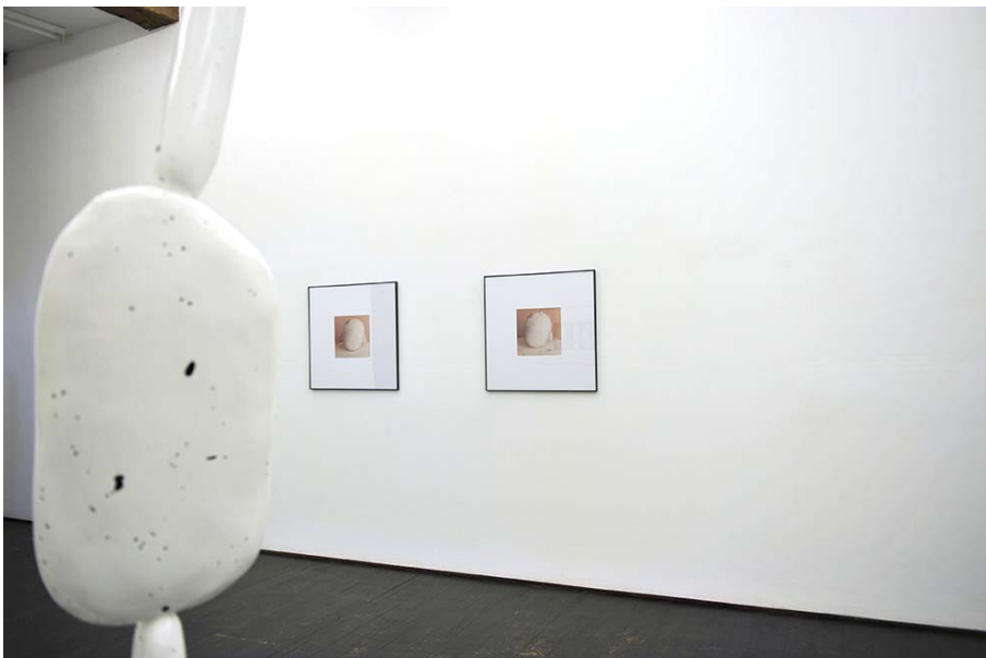
Void Flowers Exhibition View Nosbaum Reding, Luxembourg, 2015