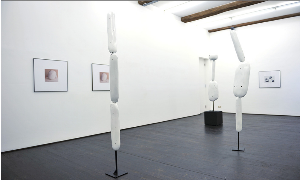
Void Flowers Exhibition View Nosbaum Reding, Luxembourg, 2015