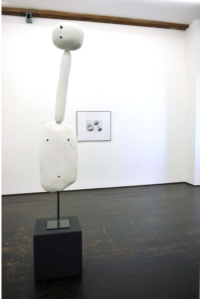
Void Flowers Exhibition View Nosbaum Reding, Luxembourg, 2015