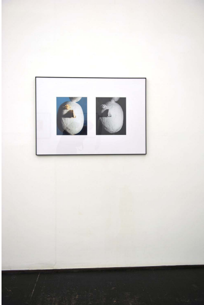
Void Flowers Exhibition View Nosbaum Reding, Luxembourg, 2015