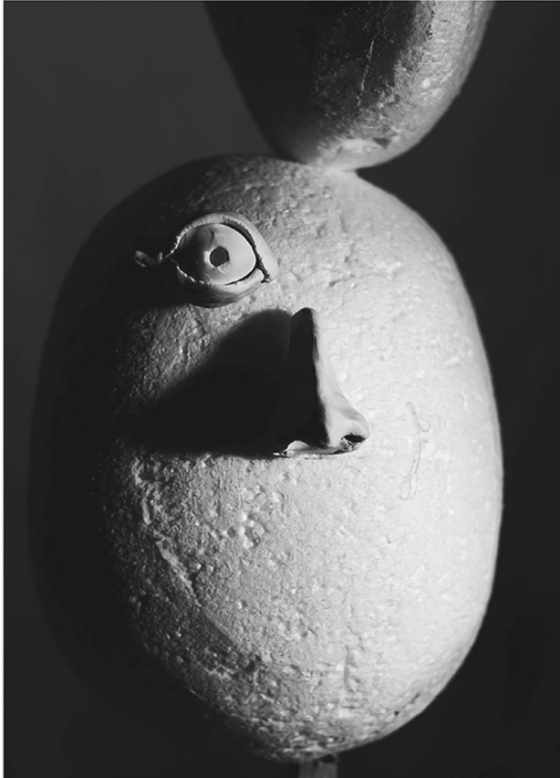
Void Flowers Exhibition View Nosbaum Reding, Luxembourg, 2015

Gallery Nosbaum Reding 2 + 4, rue Wiltheim L-2733 Luxembourg / T (+352) 28 11 25 1 / reding@nosbaumreding.com