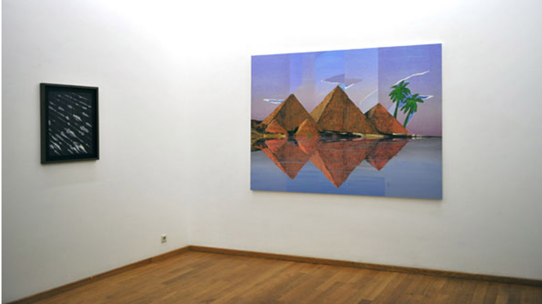
Works in at least two dimensions Exhibition View Nosbaum Reding, Luxembourg, 2013